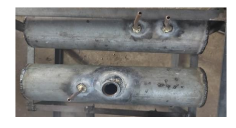
Fig-3.7: Air and tack coat storage tanks

Tack coat is a special bitumen emulsion. based on high quality bitumen and fillers. It is a thixotropic, cold applied high build bitumen based coating. The dry film of tarcoat provides a watertight barrier, which is highly resistant to chlorides and sulphates/present in the soil. Tack coat is ideal for the various process due to its ease of application. Tack coat is more viscous fluid and it cannot be freely sprayed through a nozzle. So a part of compressed air is fed into the tack coat storage tank from the air storing tank using t-joint. This will increase the pressure inside the tack coat tank and the compressed air easily pushes the high viscous tack coat across the nozzle resulting in smooth spraying of tack coat over the pothole. The flow is manually controlled by an ordinary boll valve. The tank is made from MS pipe. It consists of 9cm diameter and 35cm length. And there are three holes made in the tank for pouring of tack coat into tank, tack coat flow from the tank and compressed air flow into the tank.