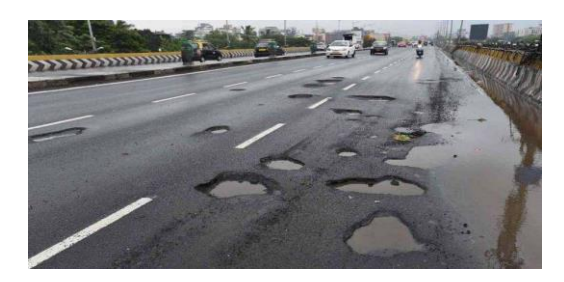
Figure -1.1: Pothole in roads

tackle the problem to prevent the deterioration of road surfaces.