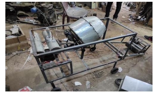
Fig-7.1: Proposed machine