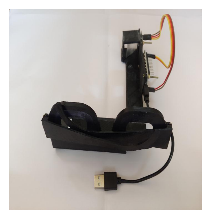
Fig -1: Block diagram

doctor takes more attention to the patient. The OLED lens display the temperature, pressure, and heart beat information about the patient