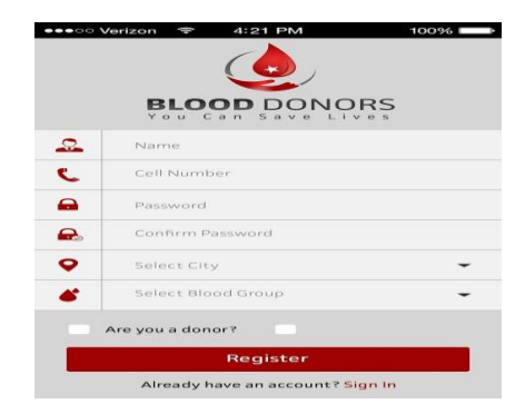
Fig -2: Mobile based Application (Homepage)