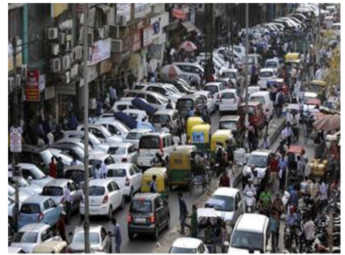
(Present parking scenario)

4) In manual parking system more guard is required for the entire work resulting in increased cost. [3]