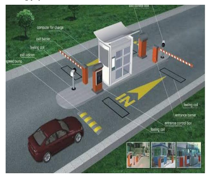
(Entrance and exit of proposed system)

5) exit time of a vehicle from a lot it is checked if the parking reservation is exceeded, if so the user has to make the remaining payment before checkout.