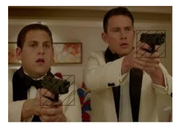
Fig -3: gun detection