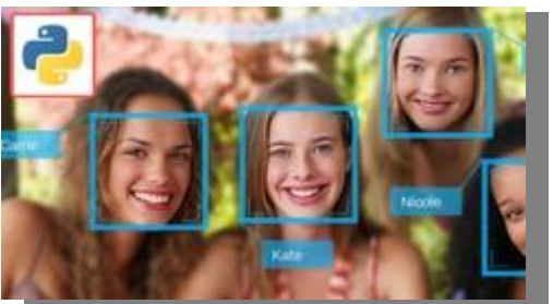
Fig -1: face detection