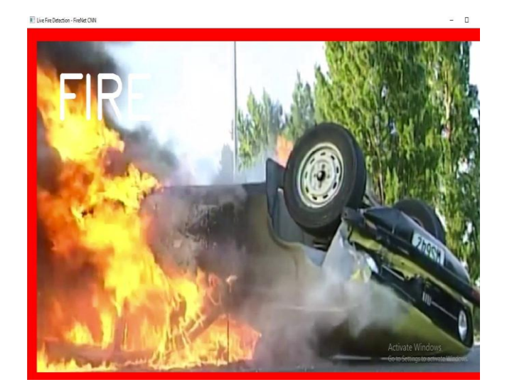
Fig -4: fire detection

In this paper we learned how to automatically detect the fire pixel regions in video (or still) imagery within real-time bounds without reliance on temporal scene information. As an extension to prior work in the field, they have considered the performance of experimentally defined, reduced complexity deep CNN architectures for this task. Unwanted fire causes many disasters. Thus, fire detection (as shown in fig- 4) has been an important phenomenon to save human life. Fires are one of the main causes of death amongst the world. In this paper we learned how the detection can be done by using computer vision and image processing techniques to detect fire flames based on studying the fire properties besides an alarm notification system. In this paper we learned how using CNN, fire detection is done.<sup>[3]</sup>