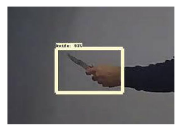
Fig -2: knife detection