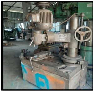
Fig.No1. Conventional Drilling Machine

Current the Suvarna alloy, kagal is using vertical drilling and tapping machine which produce Street lamp casing component per month is 3700 street lamp casings.