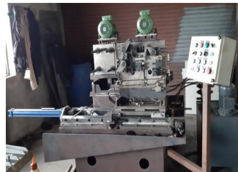
Fig.No.2 Machine Setup