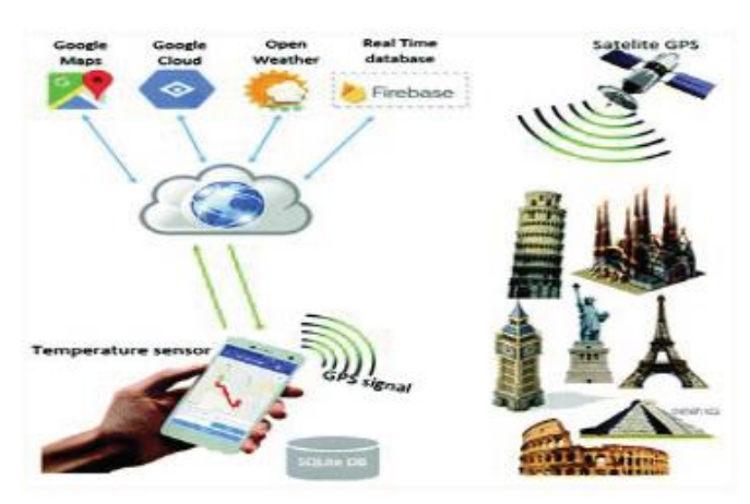
Fig -4 : Illustrates Mobile Application to Encourage Local Tourism with Context-Aware Computing

framework the board and organization from a solitary substance (for example a regional government). It also diminishes the danger of expanding heterogeneity, which is probably going to set in when various partners use their own calculation framework for information assortment and preparing related exercises.