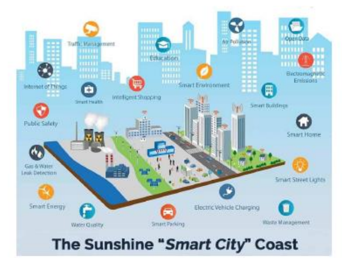
Fig -1: Illustrates a smart city features