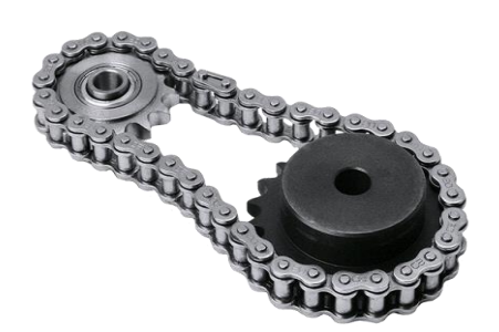
Fig: 4.1 chain drive

Chain Drive:- A Chain is an array of links held together with each other with the help of steel pins. This type of arrangement makes a chain more enduring, long lasting and better way of transmitting rotary motion from one gear to another.