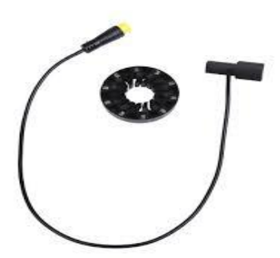
Fig: 3.9 speed sensor

Speed sensors let you accurately keep track of your current speed and level of support