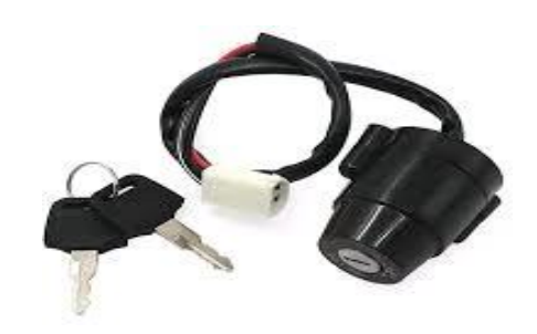
Fig: 3.7 On/off/start switch of e-bike

These mechanical switches remain common in modern vehicles, further combined with an immobiliser to only activate the switch functions when a transpondersignal in the key is detected. However, many new vehicles have been equipped with so-called "keyless" systems, which replace the key switch with a push button that also requires a transponder signal"