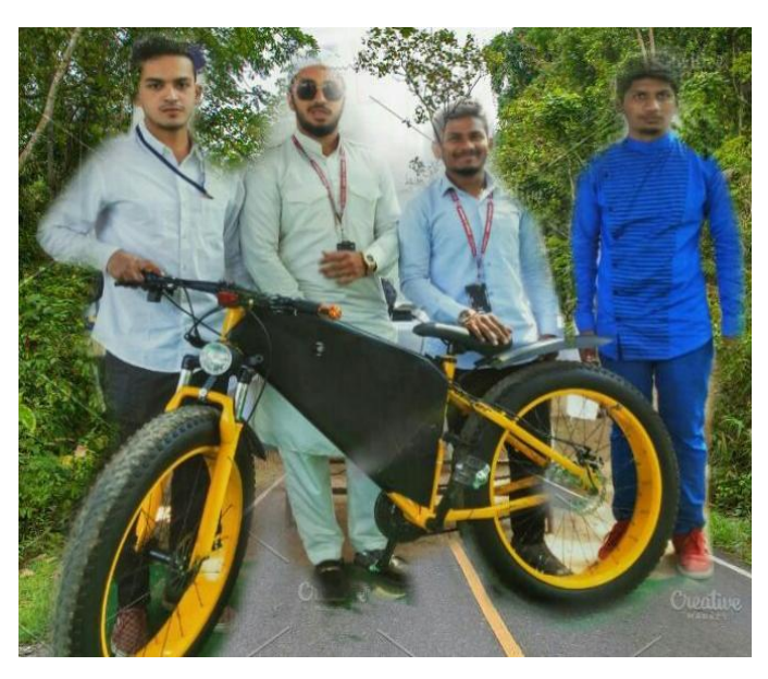
FIG: (A) FABRICATION OF E-BIKE

While discharging takes place simultaneously battery pack 2 gets charged from the motor 2 at a power rating of 36v and 5A. Though full charging of battery pack 2 cannot be done. More than half of the charge can be generated from the power generated from motor 2. Which can provide more mileage to the e-bike.