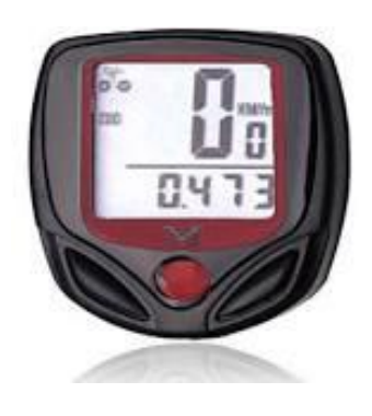
Fig: 3.8 speedo meter

A speedometer or a speed meter is a gauge that measures and displays the instantaneous speed of a vehicle.