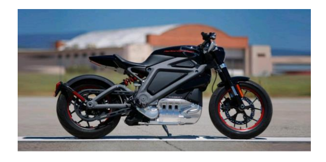
Fig:6.2 High speed bike