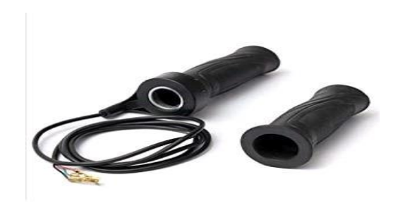
Fig: 3.4 Accelerator/Throttle

A throttle allows you to pedal or just kick back and enjoy a "free" ride! Most throttles can be finetuned like a volume dial between low and full power.