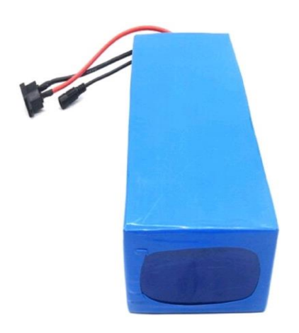
Fig: 3.5 Li-ion Battery

Volume: 07 Issue: 05 | May 2020 www.irjet.net p-ISSN: 2395-0072