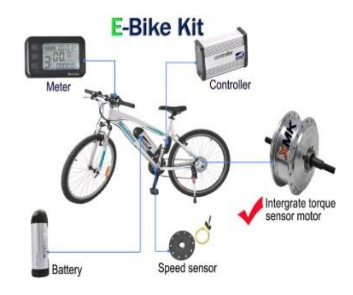
Fig: 3.1 E-bike and its component