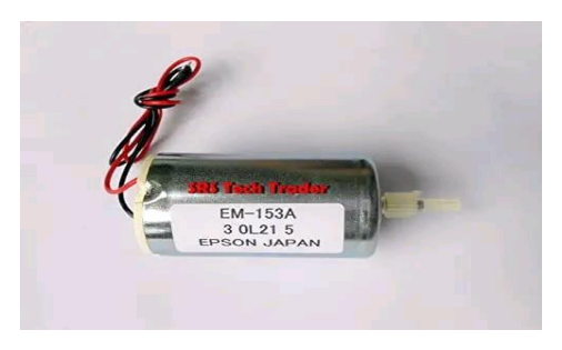
Fig: 3.6 Generator or alternator or dynamo

Epson DC 36V-Generator-High-quality-motor-1200-4200RPM...Input speed: 1200-4200RPM Output voltage: DC136V Original Japanese Generator Motor.Output diameter of axle: 2.5MM Gear attached to the Shaft is removable.