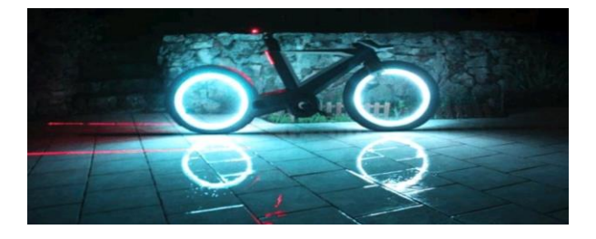
Fig: 6.3 Future developments with no spokes and creative concept.