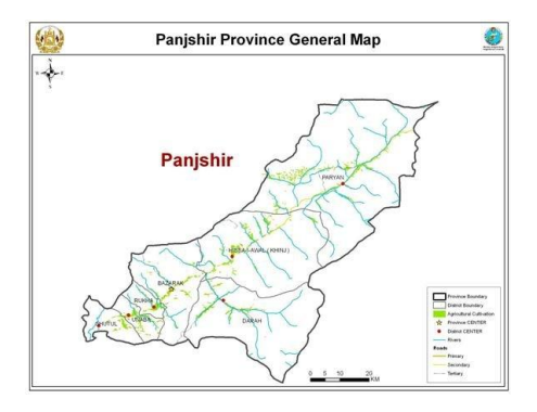
Figure 5.Panjshir river basin

Panjshir river flows from the heights of Hindukosh Mountain, 3000 to 6000 Meters from the Sea level, from Guzargah e Anjuman, Chamar and Kotal e Khawak. Its source is the snow which is stored in heights of this mountain during the winter and gradually melts during the spring and summer and also the seasonal rainfall during spring and fall. The average raining level in Wadi Punjsher was calculated 250-450 Mile Meters. Its water storage is Wadi Punjsher and its length is 125 KM having 126 big valleys and having 19 sub-rivers. The main Advantage of this river is that in the heights of Punjsher mountains, only in Paryan district there are natural refrigerators with a total area of 19.37 KM ^3 (at the year 2000) which supply this river's water permanently. In addition, there are natural pools which store a remarkable amount of water and that is why this river has attracted more attention. Figure 5, [3]