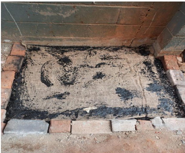
Fig. 7.5.1 GEO-JUTE(2mm)