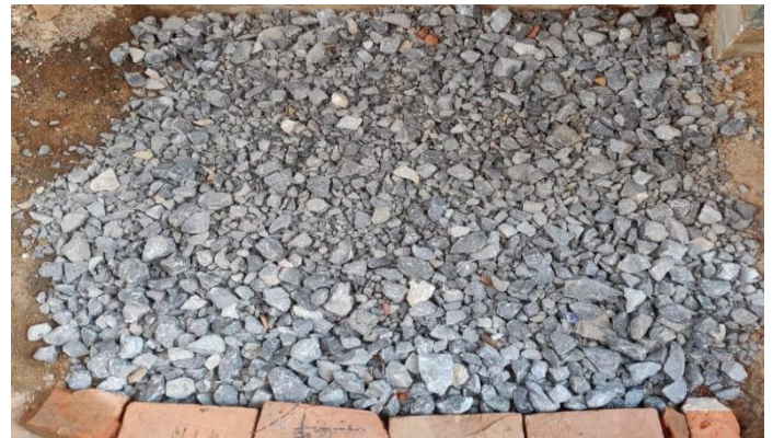
Fig.7.3.1 BASE COURSE