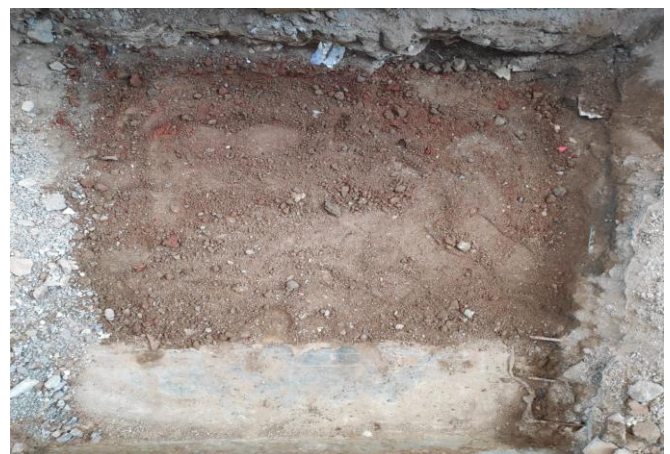
Fig.7.1.1 COMPACTED SUBGRADE 7.2 GEO-JUTE FABRIC 1 st LAYER(4 mm)