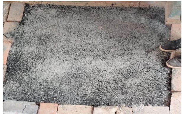
Fig. 7.6.1 SURFACE COURSE