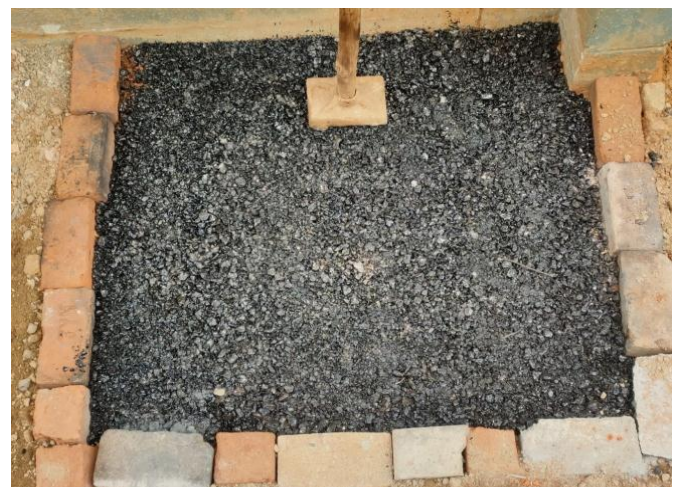
Fig.7.4.1 BINDER COURSE