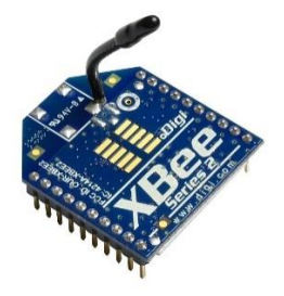
Fig5.5: ZIGBEE Module

ZigBee is supposed for devices which require simple wireless networking and don't need high data transfer rate. These devices may be for example sensor network, information displays, home- and industrial automatic systems, etc. Main benefit compared with Bluetooth is lower power demand, quick respond from sleep to awake and price. ZigBee works in most cases at 2.4 GHz radio band frequency with data transmission rates from 20 to 900 kb/s. ZigBee protocol supports different types of network like star, tree and generic mesh. Network nodes can have different roles like coordinator, router or end device.