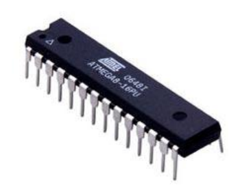
Fig 5.1: ATMega Microcontroller

Atmel Corporation manufactures ATMega microcontroller and it belongs to AVR family . It is based on Harvard Architecture and an 8-bit microcontroller with Reduced Instruction Set ( RISC ). The standard features on ATMega microcontroller are data EEPROM, on-chip ROM, Data RAM, Serial Interface Ports, Timers and Input / Output Ports, along with extra peripherals like Analog to Digital Converters (ADC). It has more number of instruction set and the program memory ranges from 4K to 256K Bytes.