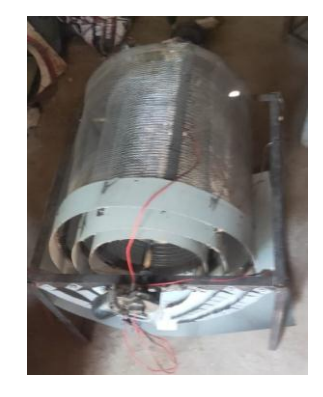
Figure 2. Trommel Assembly.

In trommel three sieve were kept. There are screen three particles aggregate high grade, medium and fine. Grade to operate 1-12 degree (0) of inclination,