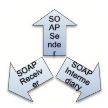
Fig - 1: SOAP nodes

The Structure of the SOAP message consists of the following elements: