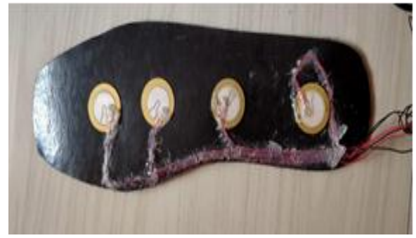
Fig -2: Piezo Sensor

We have used piezo sensors to count the steps user have stepped. There are four piezo sensors attached to the inner sole. If two of them are senses the pressure then it is said that the user has stepped a step. Like this approach, we are counting the steps of the user. Whenever a step is sensed a counter is increased and this is sent to the cloud server. Cloud server stores this information and this information is displayed on the mobile application.