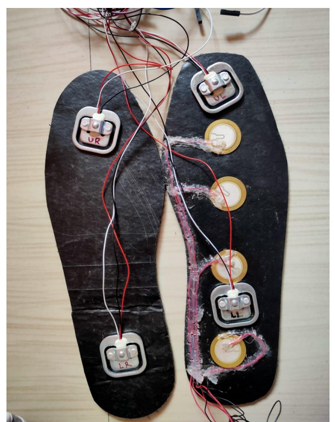
Fig -4: Load Cell

We are using a 50kg half-bridge load cell to calculate the weight of the user. These load cells are connected to an amplifier to amplify the voltage pulses. The amplifier is connected to Arduino nano which amplifies the load cell's voltage pulse and sends it to the microcontroller. The output of the amplifier is then calibrated to get the accurate weight of the user.