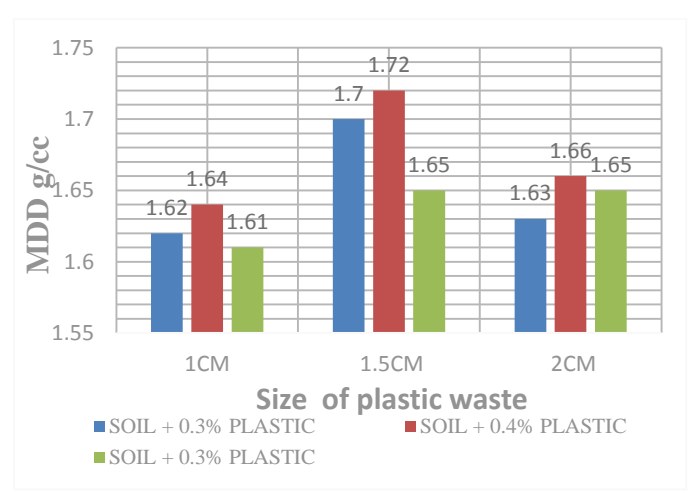
Fig.1. maximum dry densities withvarious percentages of plastic waste

For above results the OMC and MDD values are compared with different percentages and different sizes of plastic straws. In 1cm size of plastic straws for different % of plastic straws 0.3, 0.4 and 0.5. The OMC values are minimum at 0.4% and the maximum dry density is 1.64 g/cc. In 1.5 cm size for different % of plastic straws 0.3, 0.4 and 0.5. The OMC values are minimum at 0.4% and maximum dry density is 1.72 g/cc. In 2cm size for different % of plastic straws 0.3, 0.4 and 0.5, the OMC values are minimum at 0.4% and maximum dry density is 1.66 g/cc. Finally the minimum water content and maximum dry density is obtained at 1.5 cm size at 0.4% of plastic straws mixed. Further decrease of maximum dry density values are due to the used plastic material specific gravity is low and it occupies the more space in between of particles.