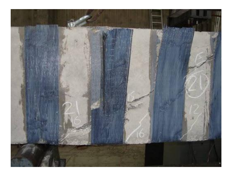
Fig - 4 : Debonding Failure in RCC Beam

International Research Journal of Engineering and Technology (IRJET)e-ISSN: 2395-0056Volume: 07 Issue: 07 | July 2020www.irjet.netp-ISSN: 2395-0072