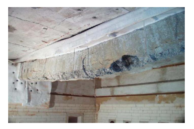
Fig -1 : Flexural Failure in RCC Beam

Flexural strength, also known as modulus of rupture, bend strength, or fracture strength, is a material property, defined as the stress in a material just before it yields in a flexure test. The flexural strength represents the highest stress experienced within the material at its moment of rupture. It is measured in terms of stress. To overcome this type of failure, main steel is provided at the bottom/top of the beam. Flexural failure occurs at mid span of beam. There are many causes of flexural failure.