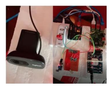
Fig -3: Transmitter end -Black Box

At transmitter end the bike shall install the proposed system "Black Box". The installation process is as follows.