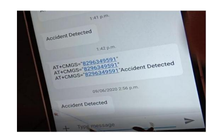
Fig -4: SMS received

Code is written so that it sends a SMS through GSM using ATD commands whenever the tilt sensor is activated. When accident happens, the tilt sensor goes active high, the GSM is programmed to generate SMS to be sent to the contact number which is pre-coded.