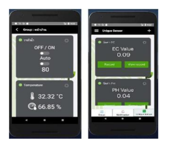
Fig. 4. Individual sensor page on Android application (a) humidity and temperature monitoring (b) EC and pH monitoring.

Humidity and temperature sensors can be accessed by clicking on individual tab and then choose the automatic or manual foggy solenoid valve control in Fig. 4 (a). If automatic system is chosen, the valve will switch on when the humidity is less than 25% then the valve will switch off when the humidity is equal 28% automatically. For the EC and pH monitoring, the users can access to individual tab and then they click on the sensor that they need to observe. The EC and pH values of each tank can be displayed sensor history on 'view record' button. We can record the EC and pH values separately of each nutrient solution tank by clicking 'record' button shown in Fig. 4 (b).