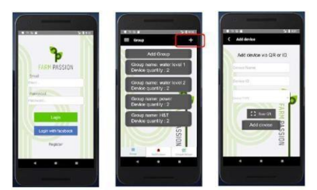
Fig. 3. Android application result (a) log in page (b) add device (c) add device using QR code or sensor ID

In the Android mobile application, users can log in to the application using Facebook account or register for the new account in Fig. 3(a). To use the automatic control and management system, we have to add sensor device as the plus icon '+' in Fig. 3(b). We can match the sensors as group of sensors or add individual sensor by scanning QR code or filling up the sensor ID shown in Fig. 3(c)