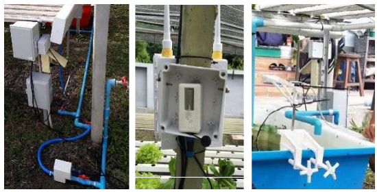
Fig. 2. Sensor installation (a) foggy solenoid valve (b) humidity and temperature sensor (c) water level sensor

The proposed sensors are installed at northern Thailand hydroponic farm as shown in Fig. 2. There are 6 sets of sensors installed: a set of pH sensor, EC sensor, power outage detection, humidity and temperature sensor, and 2 sets of water level control. The power outage detection sensor is divided into wireless transmitter and wireless receiver. The transmitter plugs in at the power socket and the receiver plugs in at the UPS. The humidity and temperature sensor is paired with foggy solenoid valve. The 2 ultrasonic sensors