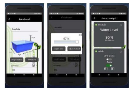
Fig. 5. Android application result (a) tank volume estimation (b) water level adjustment (c) water level monitoring

To set the water level of each tank, the users have to enter the height, width, and length of the tank so that the system estimate the tank volume shown in Fig. 5 (a). Afterwards, the water level scale can be set the percentage of minimum and maximum water level left in the tank. We can select 'manual adjust' or 'auto adjust' menu. If manual adjust is selected, the users have to adjust the level percentage in Fig. 5 (b). On the other hand, if the auto adjust is chosen, the user just put the water into the tank as the level that they need. Then, the system records this level as the system setting. This paper sets water level manually at the level 30%-80% of the tanks. If the water level is lower than 30% of the tank, solenoid valve will switch on until the water level is equal to 80%. The results of water level monitoring on mobile application is shown in Fig. 5 (c).