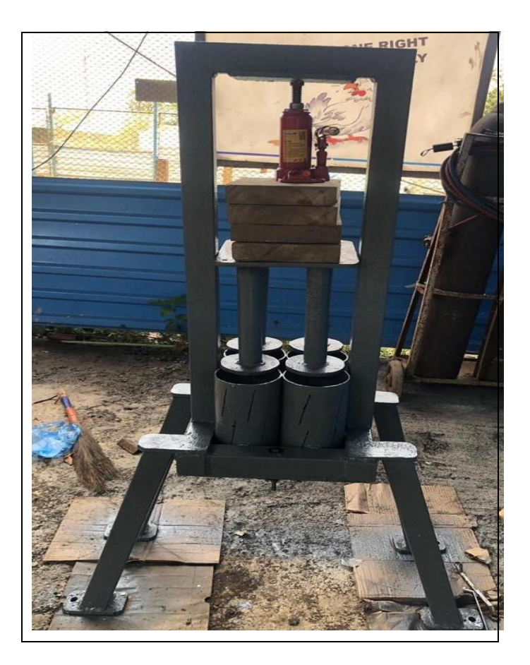
Fig -2: Developed model of Compression Machine