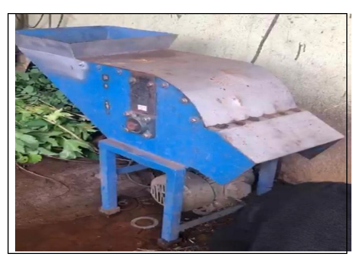
Fig -1: Developed model of Shredder Machine