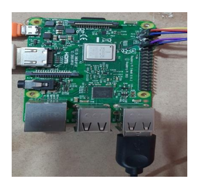
Fig-3. Raspberry pi