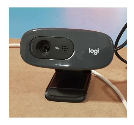
Fig-4. Logitech camera