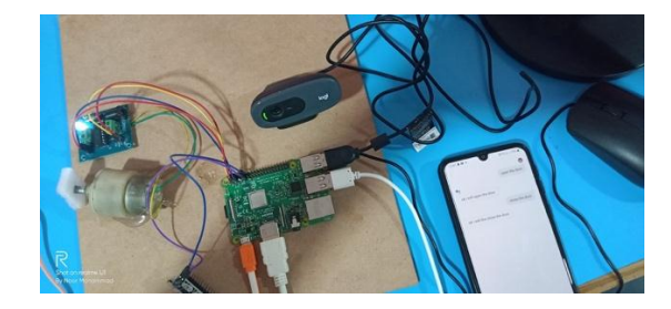
Fig-4. Top view of the project.