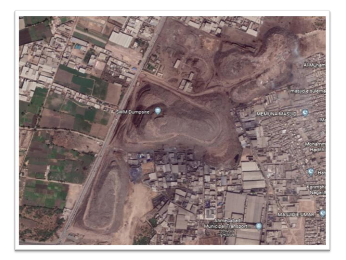
Fig. 1 pirana site

The total area of Pirana landfill site is 84 hectares. 65 hectares land has been used up so far for the disposal of waste since 1980. The average depth/height of the waste is 22 meters. As per survey conducted by Abellon Clean Engg. in Feb 2010 at Pirana dump site, food waste constitute around 40% of sample tested. There is no mechanism in Ahmedabad for ensuring Recycling of food waste. It was found that around 70,000 flies can live in 1 cubic foot of garbage. The landfill started operation in 1980 and on an average about 2500 tons/day of waste is dumped on the site with the waste filling heights varying from 20 to 22 meters. The wastes dumped into this site are largely from domestic and commercial sources. Nearly 61% of the accumulated waste is collected from municipal bins and street sweeping. More than 12500 workers are employed by AMC and they work on all 365 days of a year and twice a day - 6:30 am to 11:30 am and 3:00 pm to 6:00 pm.