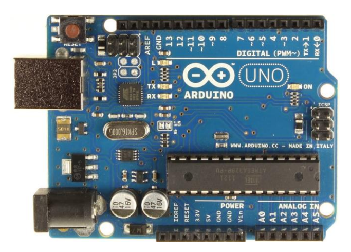
Fig - 6: Arduino Uno

Arduino Uno (fig -6) can be used as it is cheap, very much available, and best at functioning. It is based on the ATMEGA 328P microcontroller. It is easy to connect to any computer with a USB cable or power it with an AC-to-DC adapter or battery to get started. It can operate with very little voltage of 5V. It also has a flash memory of 32kb which is very high enough for this project.