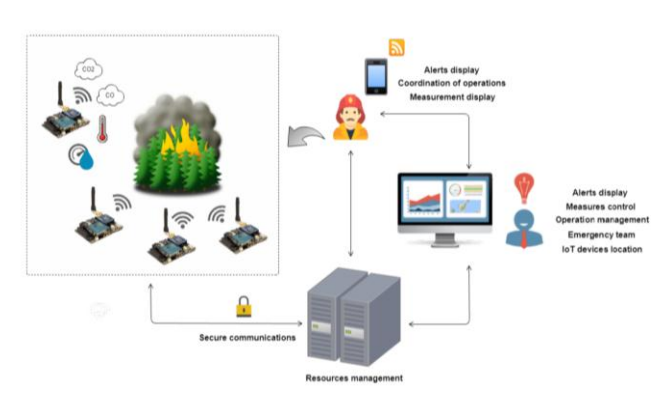
Fig - 1: Operation of the system [4]

International Research Journal of Engineering and Technology (IRJET)e-ISSN: 2395-0056Volume: 07 Issue: 07 | July 2020www.irjet.netp-ISSN: 2395-0072