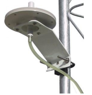
Fig – 4: OMC 509 pressure port

To measure the relative atmospheric pressure, a barometric pressure sensor should be used. For this purpose, OMC 509 pressure port (fig -4) is the best-suited component. It inputs effective static pressure to the barometric pressure sensor. Generally, wind speed above 20m/s makes it difficult for barometer inlet tube which in turn makes errors up to 4 millibars. To avoid these errors a unique parallel plate design is employed in this pressure port. It reduces the dynamic pressure errors by slowing the wind speed at the inlet. There is extremely light in weight and has 0.5mb maximum dynamic pressure error at 20m/s. [6]