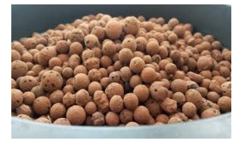
Fig-3: Light weight Expanded Clay Aggregate

Lightweight Expanded Clay Aggregate (LECA) is a manufactured and artificial lightweight aggregate which were produced by using clay, coal, perlite, and bottom ash after heating at 1200°C in a rotary kiln, the clay expanded to about four to five times its original size and took the shape of pellets. This process was originally employed to produce lightweight cubes in Scandinavia in 1930.