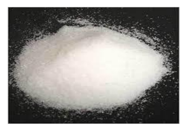
Fig-2: Sodium Polyacrylate