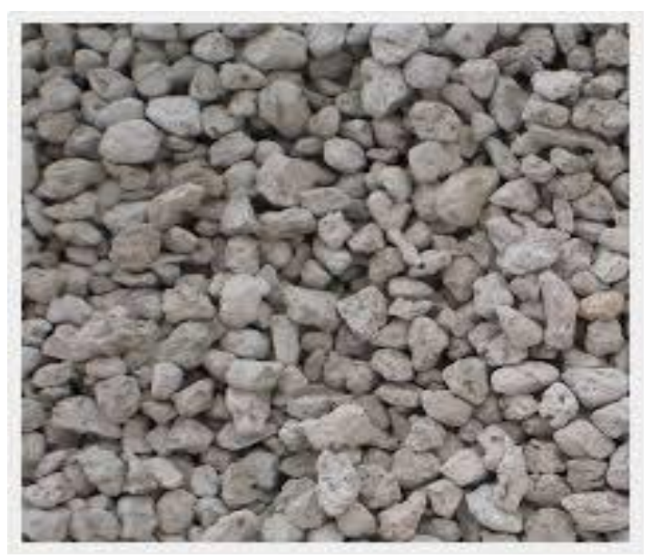
Fig-4: Pumice stone

Pumice is a porous volcanic rock which resembles a sponge. The porous structure is formed by dissolved gases which are precipitated during the process of cooling as the lava hurtles through the air. All types of magma may form pumice. The connectivity of the pore structure may range from completely closed to completely open. A representative value for the absorption of pumice is 0.27 kg/kg [19]. Burcu Akcay et al [20] experimentally investigate the Effects of distribution of lightweight aggregates (LWA) on internal curing of concrete. Different sizes and amounts of natural pumice LWAs were used as water reservoirs to provide internal