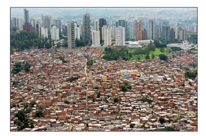
Figure: Mumbai's slum Region prompted for Redevelopment.

A written consent is required from each and each member of the Society for completing Redevelopment. Unlike the S R A Project, during a Registered Co-operative Housing Society, 100% consent of all the members is required before the Society can plow ahead with Redevelopment