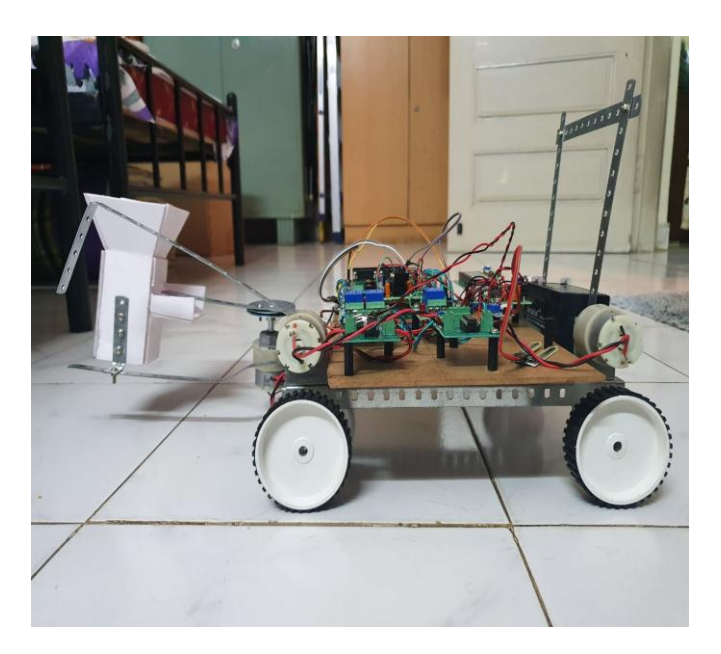
Prototype of Proposed Model