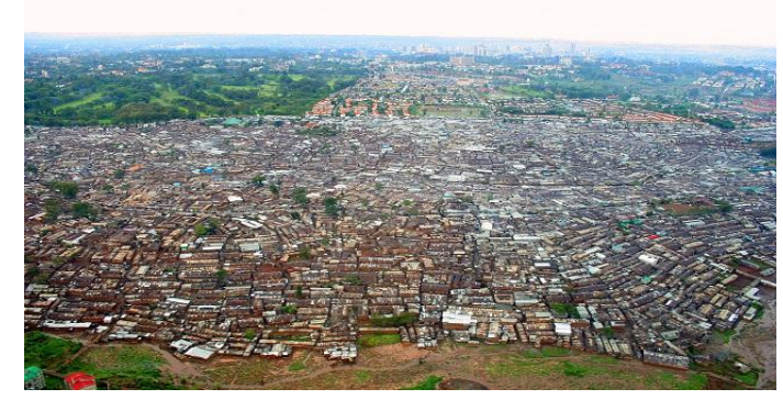
Figure 1: Poor access to the core services make the lockdown orders impossible to comply with.

Moreover, the crowded cities, where population density played a major role in the generation of economy are know the hotspots of the pandemic.