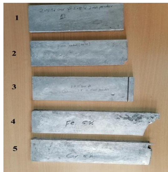
Figure 1- fabricated composite plates

The fabricate composite component is shown in figure 1.