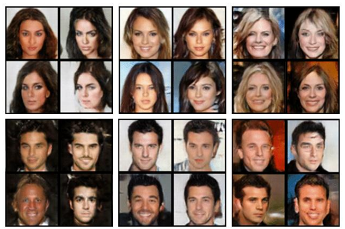
Fig -1: CelebA Dataset