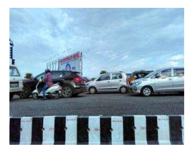
Fig. 2: Critical Gap of traffic on upstream direction.

Fig. 1: Conflict Points at a Conventional Full Median Opening Versus a Directional Median Opening.