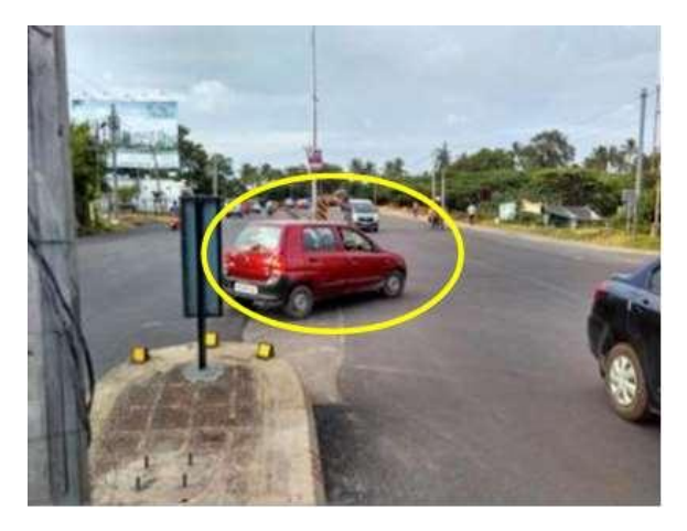
Fig. 3: U-Turn traffic on upstream and downstream directions.