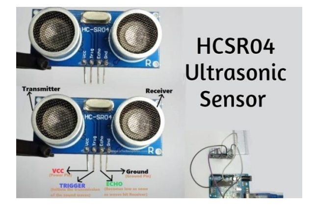
Fig -2: HCSR04 Ultrasonic Sensor

The sensor measures the time between the transmitter's sound emission and its contact with the receiver in order to compute the distance between the sensor and the item.