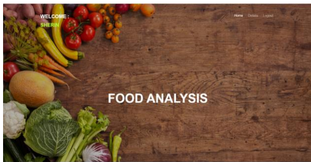
Fig – 3: web page