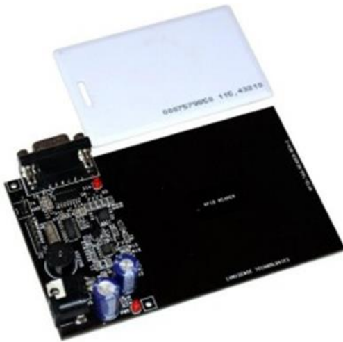
Fig – 1: RFID reader