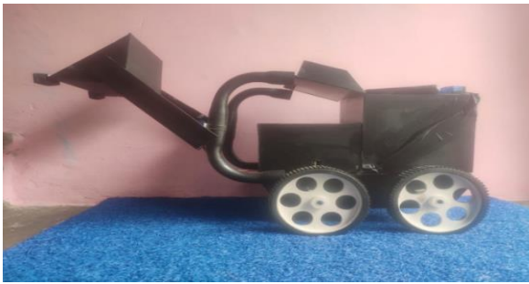
Fig: 6.1 Output Figure