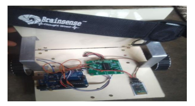
Fig-3 : Experimental Results

We have Controlled wheelchair through Bluetooth Module. Psyche wave Headset remember a cathode for forward portion of scalp reference terminal and ground anode which is associated with ear projectionThe brain sense (BCI) Mind wave Headset used as an EEG Electrode and the hardware setup of system; two-wheel robot is controlled with brain wave headset. Then the output value measured on Serial port of Arduino. It Shows level of Attention. So, the led are controlled by mind wave headset. Led's are more brighter when attention increases.