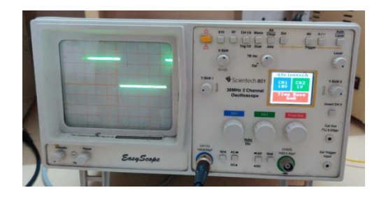
Figure 8: Conventional TENS Mode

The waveforms of each mode are shown below: