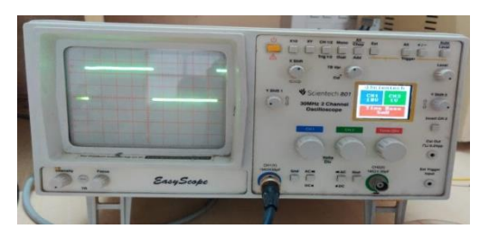
Figure 10: Intense TENS Mode