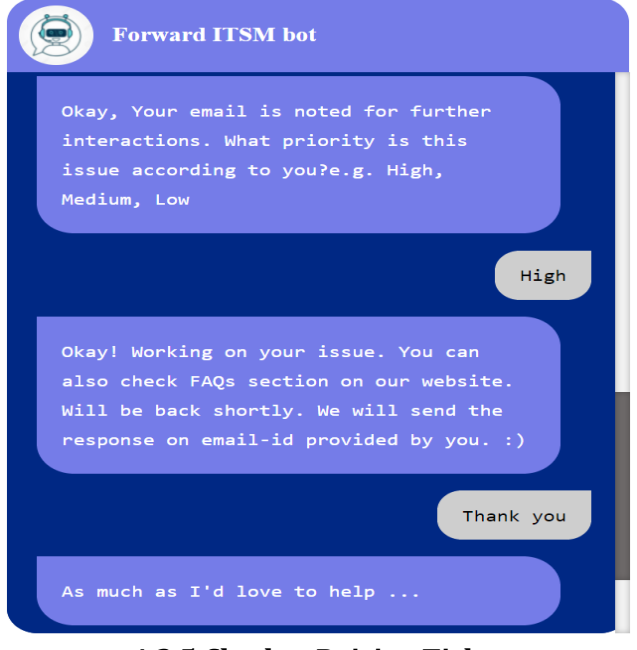
4.2.5 Chatbot Raising Ticket