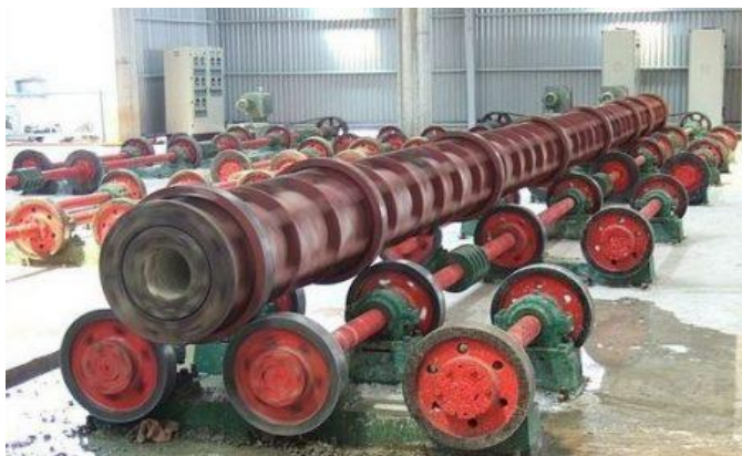
Fig-1: Centrifugal Casting Method

Centrifugal casting, commonly known as spin casting, is a process of producing hollow and tapered prestressed concrete poles. This approach involves partially filling steel Moulds with concrete and placing them in a spinning machine. The centrifugal force provided by the spinning machine, which will rotate for many minutes, consolidates the concrete in the Moulds. The concrete squeezes out water as it spins, and the surplus water is emptied out of the hollow hole made in the pole's core. Finally, the form is steam-cured for a period of time until the concrete strength reaches 3500 psi (Pound per square inch). The prestressed wire is then released and allowed to cure for 28 days in the open air. Finally, we have a hollow prestressed concrete pole.