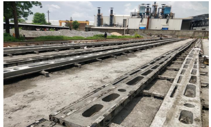
Fig-2: Long Line Method

Prestressing wires are threaded. At each end of the line of forms, these wires are pretensioned against abutments. For several poles, this pretensioning is done once. Molding shapes are now filled with concrete that has been vibrated from the outside. Many other forms of solid poles, such as square, rectangular, I-shaped, Y-shaped, and so on, may be made using this approach. Any precast site or yard can use this method.