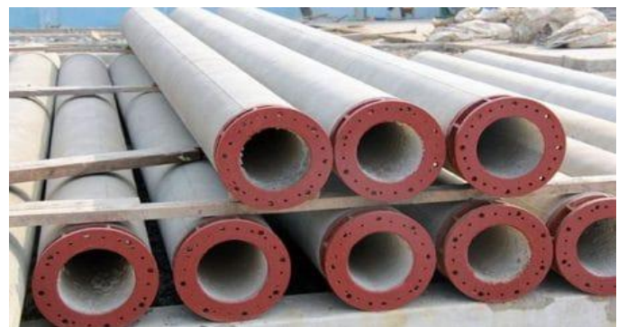
Fig-3: Mensel's Method

Mensel's method of prestressed poles making is more mechanized process. In this, poles are made on a production line which consists of horizontal light weight molds. In the production process, these Moulds will be moved from one station to the next. To produce hollow concrete poles, concrete is poured into these moulds and a block out is supplied in the center of the mould when pouring concrete. Vibration consolidates the concrete in the moulds. After the concrete starts to firm, the central block is turned and removed when it is entirely solid. These poles are heated to a temperature of 73°C for 24 hours and cooled down to room temperature.