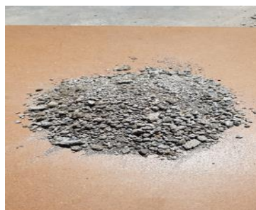
Figure 6. Crushed concrete

In this process the concrete waste material is crushed into small pieces. As crushing decreases the concrete size it can be used as a mixture for new prepared concrete.