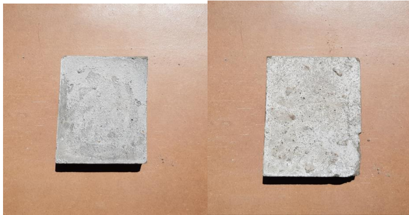
Figure 7. Recycled Concrete Mold