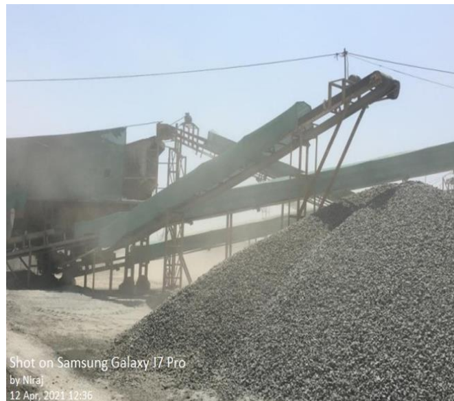
Figure 3. Belt conveyors