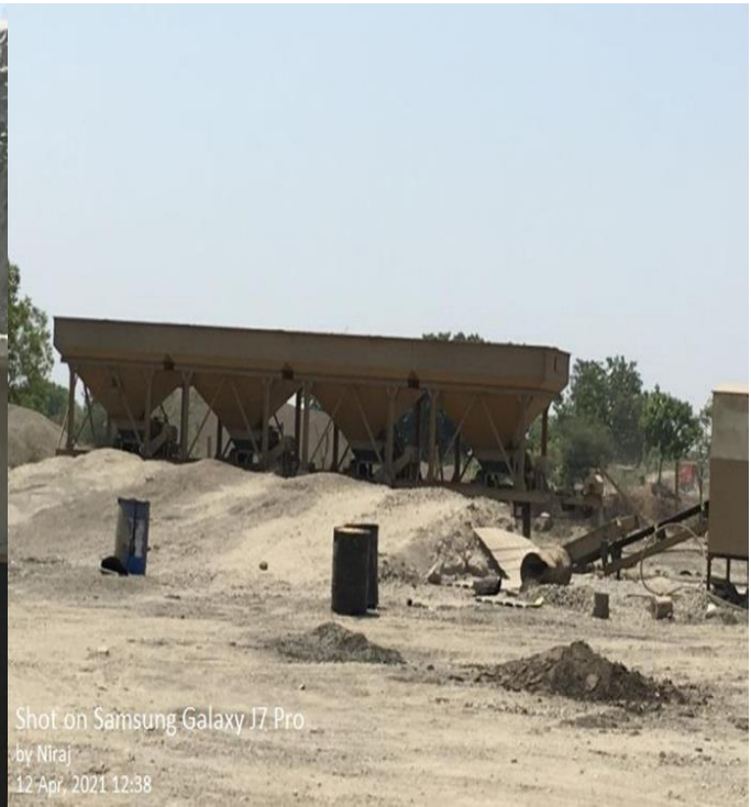
Figure 5. Hopper insulation