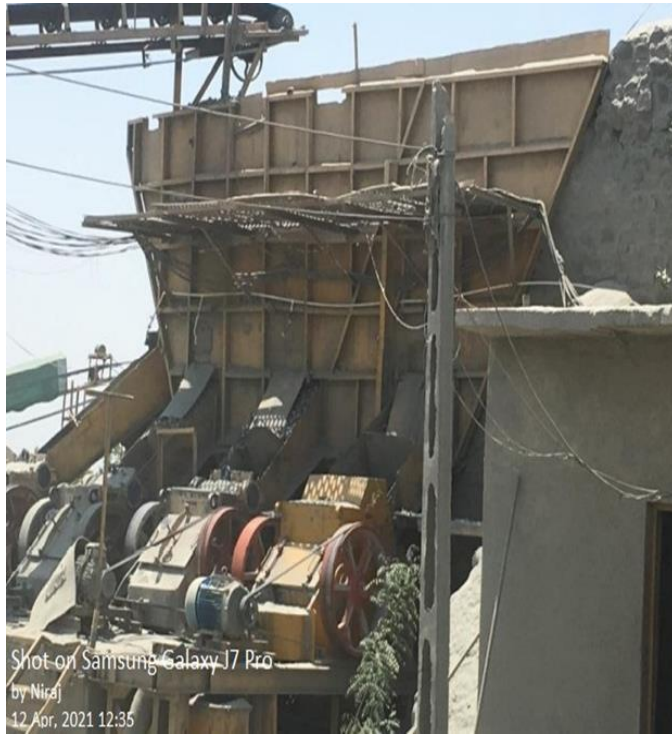
Figure 4. Hopper insulation