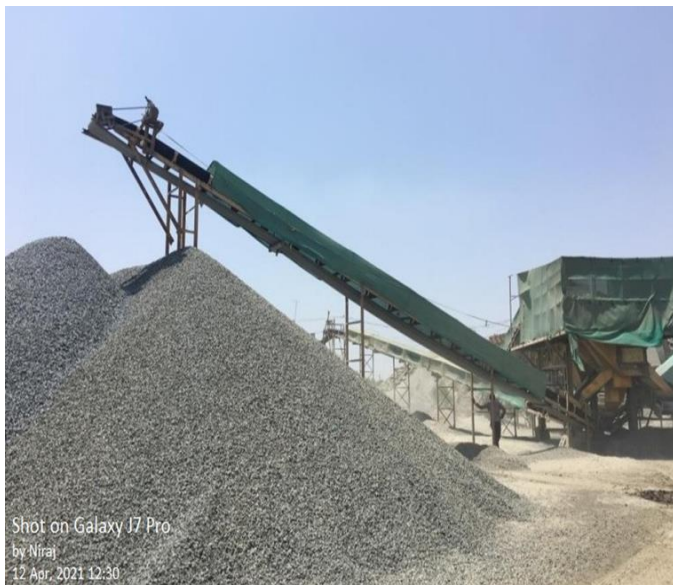
Figure 2. Belt conveyors

This Surat Green Precast Pvt. Ltd works on principle of PPP (Public Private Partnership).