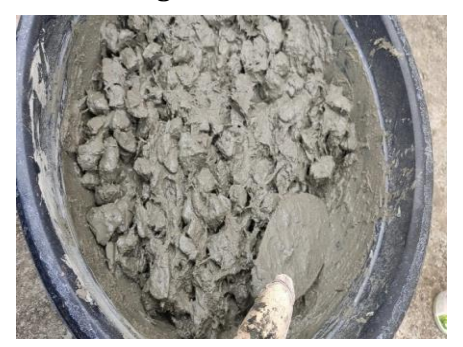
Fig-2 .Basalt fiber mix in concrete. Table -1 .Properties of basalt fiber