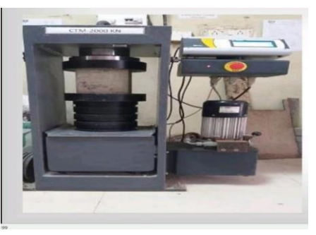
FIG-3. Universal testing machine

compressive strength test were administered and cubes of 150mm×150×150 cube size employing a UTM of 2000 KN capacity as per IS156:1959 The test concluded every 3 days, 14 days and 28days remove the specimen from curing tank and wipe out excess water from surface then put the specimen abroad base plate of the machine rotate the movable portion gently by hand in order that it touches the highest surface of the specimen abroad base plate of the specimen applied the load gradually and Continuous apply till the specimen fails. Record the ulmost load minimum three specimens should be tested at each selected day.