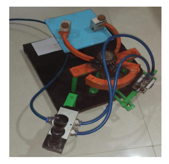
Fig -2: manufactured pneumatic self centering clamp