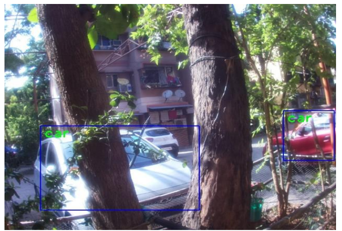
Fig -3.5: Detection of objects besides various obstructions.

After initiating the /photo command via telegram bot API the script running in Rpi for clicking pictures, performing object detection, saving the object detected image and sending it to respected user's telegram bot is executed. 80 objects can be detected present in coco data set since coco data set contains 80 classes. Figure 3.4 shows the successful detection of car, motorbike and a person standing near the shop who isn't adequately visible still the script has detected it. The accuracy for detection is set to 60% in the code, it can increased further. However increasing the accuracy is not recommended as the script doesn't prove to be much efficient then.