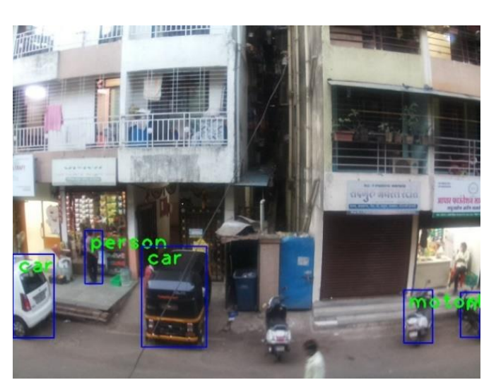
Fig -3.4: Detection of car and pedestrains.