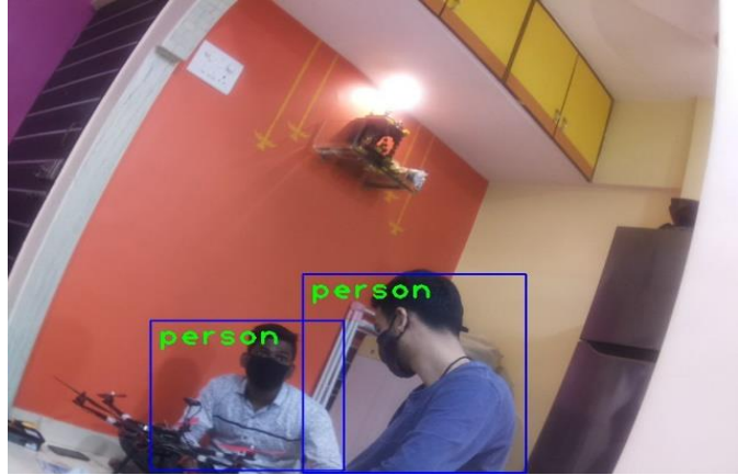
Fig -3.3: Successful detection and classification of objects

Successful detection and classification of objects, results.