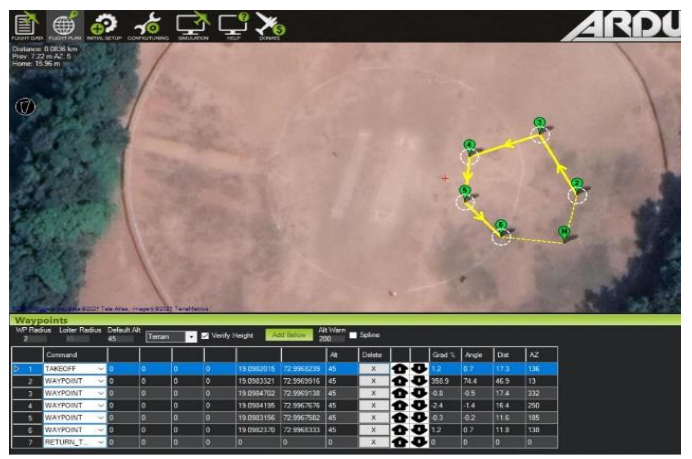
Fig -2.2: Mission assigned to the Drone.

The raspberry Pi connected to the drone functions as another secondary brain.