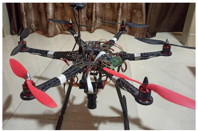
Fig -3.1: Hardware components assembled.

As visible from the figure 3.1 the drone is completely assembled, components used are Hexacopter frame S550, pixhawk 2.4.8 flight controller, propellors, 920 Kv motors, ESC's, M8N Gps module with a stand attached to it, radio telemetry and remote's transmitter and receiver, Raspberry pi 3b+ and it's 12Mp camera.