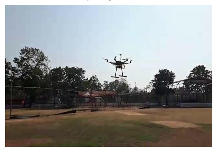
Fig -2.1: Drone's stable flight.

Caliberation of drone and radio caliberation is done via mission planner software and only after that stable is acheived. Mission planner is also used for assigning missions to the drone which includes auto take off and return to launch position modes. 3 way switch for providing additional 3 modes (3+3 = 6 total) has also been added on the flysky remote by making the switches C and D as master and slave. So now the drone can fly in 6 possible modes.