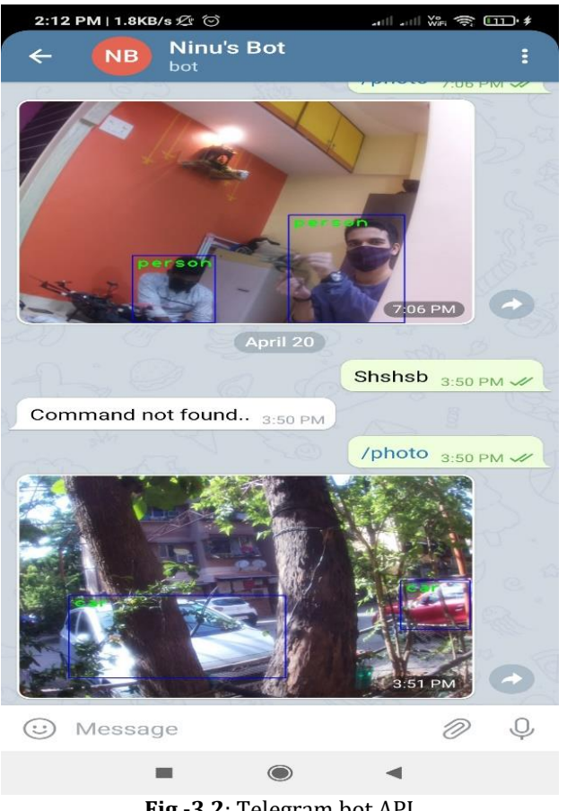
Fig -3.2: Telegram bot API

Figure 3.2 proves the correct working of telepot (telegram bot API) which works as a medium to send commands to the Rpi. Based on those commands the Rpi will respond. As visible, if any other command other than /photo is sent, the Rpi will quickly respond by sending "Command not found" to the user's bot. Only the specified command i.e /photo can be used for receiving object detected images. As seen from the figure 3.2 Raspberry Pi can quickly respond to the user's command in few milliseconds.