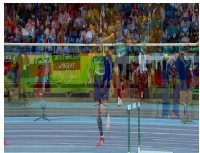
Fig -2: Composite Running Style Comparison

We observed the unique running style of gold medal winner, having a flying type of running during the stride period. Also his hands were behind his body to create enough pace of his body before jumping. The silver medalist on the other hand, used a very short step in the beginning and the end of the stride period. The comparison between the gold and bronze medalists was shown as a composite image in Fig-2 for understanding. Note that the fly type running found in gold medalist (Running athlete's image in the behind)