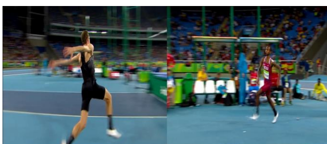
(b) Hand Positions (Gold & Silver Medallists)