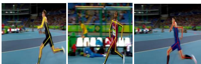
(a) Run Type (Gold, Silver & Bronze Medallists in Order)

The run type and the hand position of different athlete are also shown in Fig -3 (a) and (b) respectively.