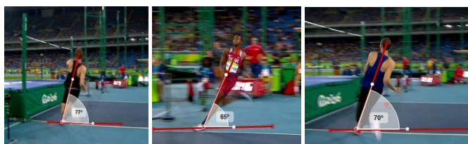
Fig -1: Approach Body Angles

The videos of three players are synchronized so that we got a simultaneous time of approach phase. This phase has running and the lifting point with one leg. We observed the approach angle, number of steps of running before jumping, the running type and hand movement during this phase. Fig -1 shows the readings of approach body angle.