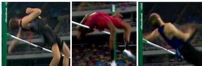
Fig -6: Body Height from Bar

The height of the body from the bar is very important for each trial, as this will ensure the athletes to jump higher heights every time. In the performance comparison shown in Fig -6, it is very clear that the ability of maintaining higher height is depending on the talent level.