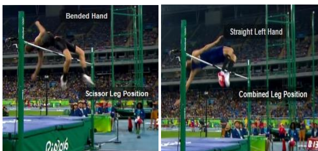
Fig -7: Hand & Leg Positions During Flight

The leg and hand positions of the athletes during flight were shown in Fig -7. Gold and silver medallists used scissor leg position but the bronze medallist used a combined leg position. And the hand position also played a vital role in gold medallist by bending the right hand (other than the reaching hand) during the flight.