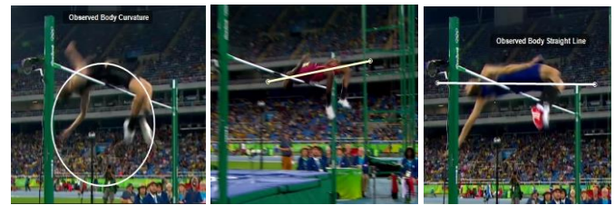
Fig -3: Running Style Comparison