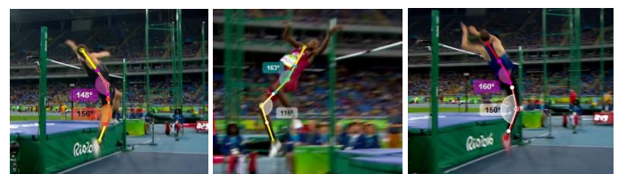
Fig -4: Take-off Positions and Angles

Fig -4 shows the angle variations and positions of all the athletes.