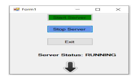
Figure 2: Server Application with "Running" Status.

changed to 'RUNNING' and once we click on stop server it shows status as 'STOP'.