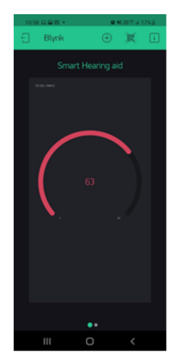
Fig. 7 Sensitivity reading on Blynk App

Furthermore, when the current system's features are compared to the developed system's, the latter appears as the better alternative in terms of cost, mobility, and design. Many users, particularly in developing nations, will be able to use the proposed equipment.