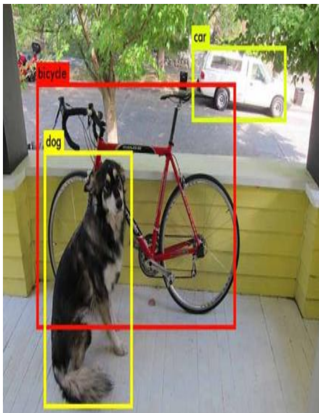
Fig 2: Recognizes Images in front of User

Raspberry pi is preprogrammed with Python code it facilities with an app interface called Blynk app where it is interconnected it fetches the data collected by MC's and display the output using GUI by pushing the button on it. We should preprogram some of its the library by firstly gathering and organizing data to work with and secondly build and test a predictive model. Thirdly use the model to recognize images which we come across daily the basic things that lie around us connecting a camera in front of the stick.