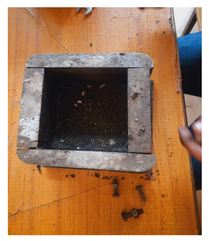
Fig 3 Casting

Compressive strength (N/mm2) = (Ultimate load in N / Area of cross section (mm2))