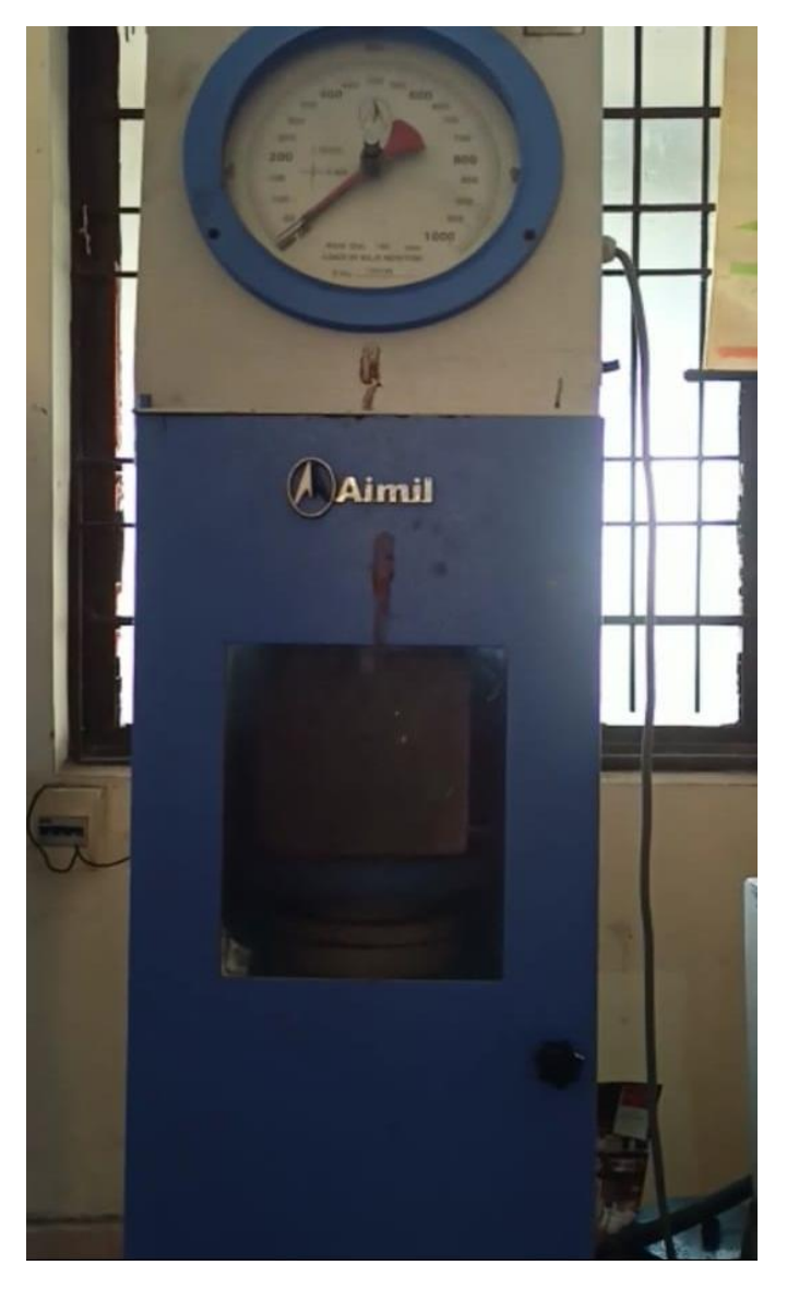
Fig 5 Experimental Setup for Compression test