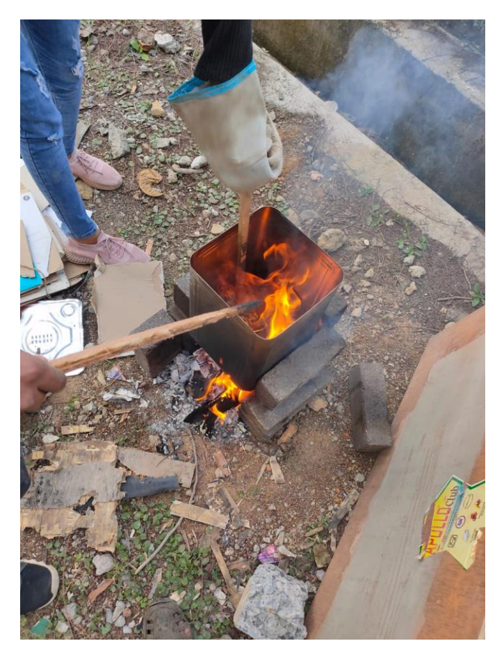
Fig 2 Adding