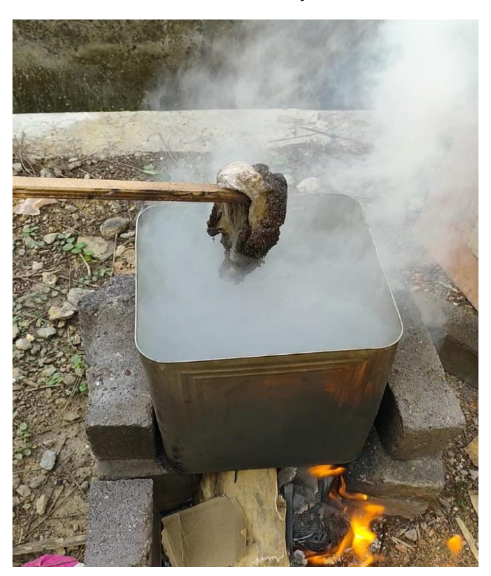
Fig 1 Heating

Plastic garbage is cooked in an oil tepa at temperatures over 150. The plastic garbage melts as a result of heating. Materials In the molten state of plastic, ceramic waste, aggregates, and other elements mentioned in the preceding chapter are added in the right proportions and well mixed. The metal mould is thoroughly cleaned with a waste towel. This mixture is now being transferred to the mould. It will be heated and compacted in order to limit the number of interior pores. The blocks are then allowed to cure for 24 hours in order to solidify. When the paving block has dried, it is taken from the moulds and is ready for_use.