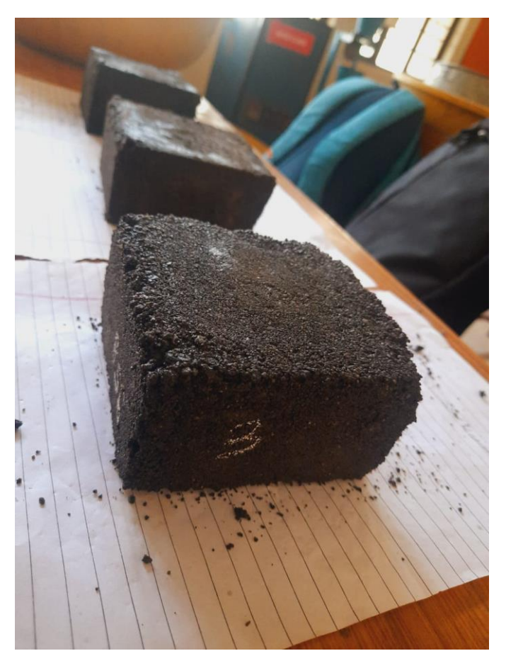
Fig 4 Drying