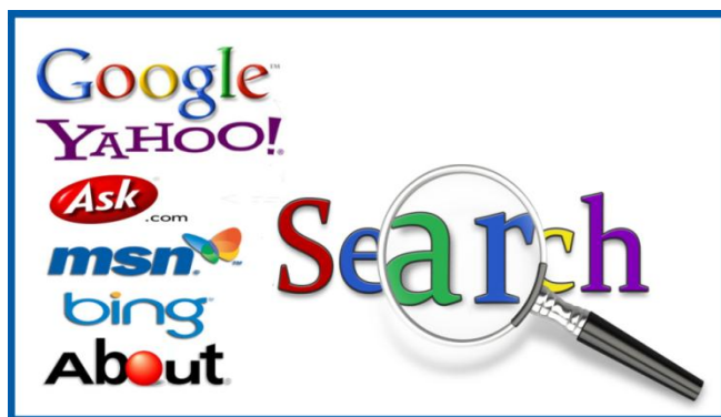
Figure 1: Various Search engines.

A search engine is software that allows users to search for information on the WWW (World Wide Web). This software is designed to retrieve specific information. By scanning and indexing information on millions and billions of websites, the search engine is able to present relevant web pages to the user. When the user starts searching for a particular topic it shows the most updated website to the user. The information may consist of web pages, information and other types of files. Our Search engine works through Google API. The user will search for the particular information in search operation that gives only the wanted information and avoids unwanted pop ups like advertisements using filters and plugins. This helps the user not to distract to any of the unwanted information.