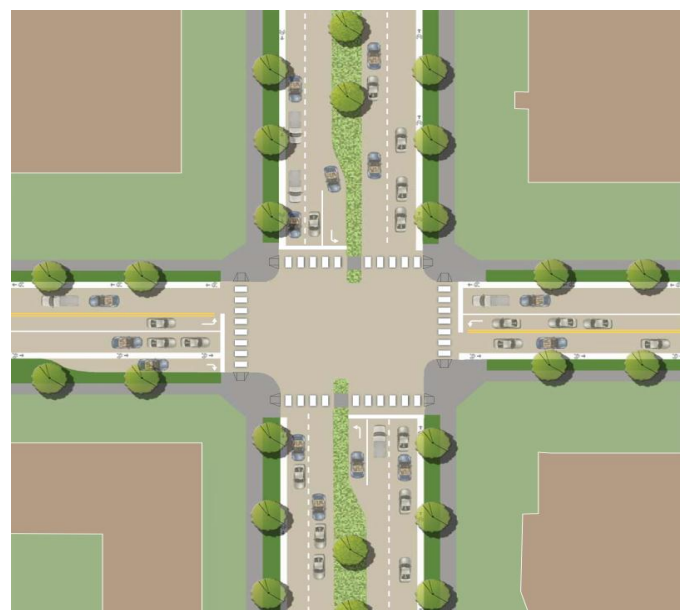
Figure 4: Boulevard Intersection Layout