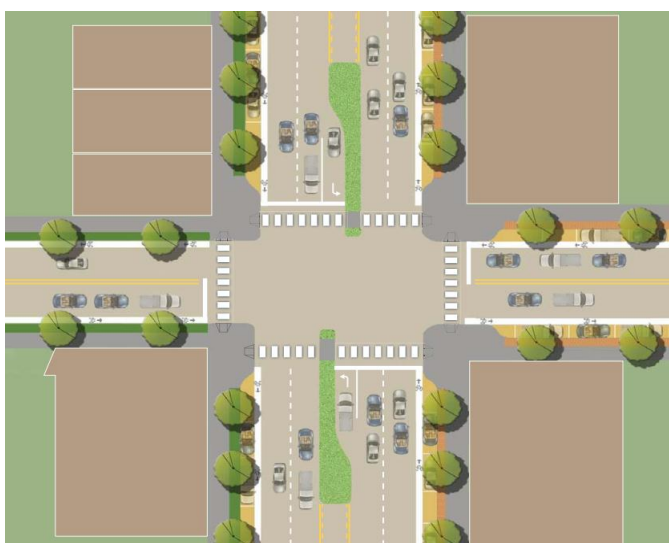
Figure 5: Avenue Intersection Layout