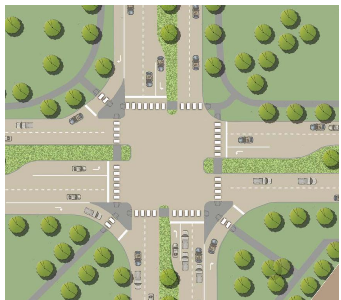
Figure 6: Parkway Intersection Layout