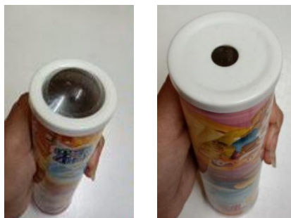
Plate 1 - Kaleidoscope

A kaleidoscope is an optical device with two or greater reflecting surfaces (or mirrors) tilted to every different at an attitude, in order that one or more (elements of) items on one end of the mirrors are visible as a normal symmetrical sample whilst considered from the opposite end, because of repeated reflection. The reflectors are usually enclosed in a tube, frequently containing on one end a cell with loose, coloured portions of glass or different transparent (and/or opaque) substances to be contemplated into the considered pattern. Rotation of the cell results in movement of the substances, ensuing in an ever-converting view being presented.[48]