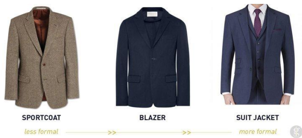
Plate 3 - Difference between sport coat, blazer and jacket [52]

The distinction between a sport coat, blazer, and suit jacket comes right all the way down to styles, buttons, and material.