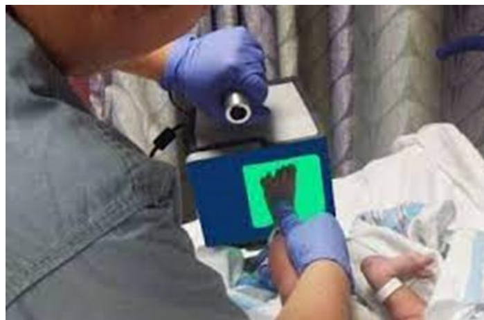
Figure 4: Footprint scanner

Footprint Identification Technique (FIT) With advanced technology, fingerprint scanner helps to verify people on their unique fingerprints. Where the footprint scanner is very useful for the identification of infants. we can't take a sample of a newborn baby's fingerprint because till the age of 12 the fingerprint ridges vary and the palm has also closed the baby, so it is not possible to take an accurate palm print through the scanner. So we are going to take the footprints to identify and verify the abundant baby with their parents. if they are left or abandoned then it is useful to match this footprint which is stored in the parent's Database because that baby's id isn't available. Babies' footprint is unique and computerized scanning of footprints can be useful to verify the child in the event there is an incident. We are going to footprint scanner as same as a fingerprint scanner.