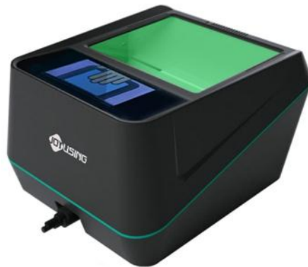
Figure 3: Fingerprint Scanner

In 1900 Sir Edward Henry of England use fingerprints for criminal investigation which was compared slowly by hand. This process is underdone from the crime scenario and another biometric from the suspect which is compared under the magnifying scope. but biometric fingerprints taken sometimes look quite different because smudging fingerprints from the crime scene to compare and proof needs more accuracy and great skills. That's why the forensic researcher produced an easy system for matching the biometrics where they look between 8 and 16 distinct characteristics.