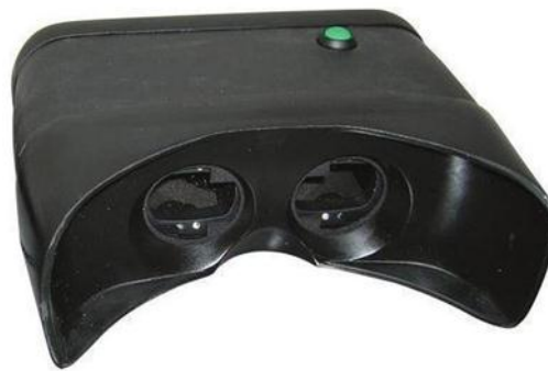
Figure 2: Iris scanner