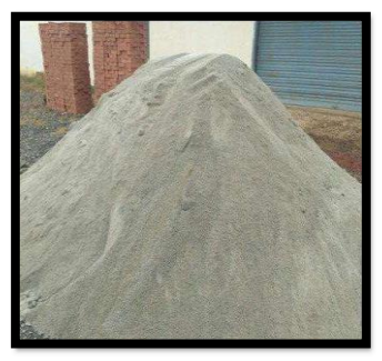
Fig. 3: Manufactured Sand

Sand is used as fine aggregate in mortar and concrete. Natural river sand is the mostpreferred choice as a fine aggregate material. (Fig. 3.)