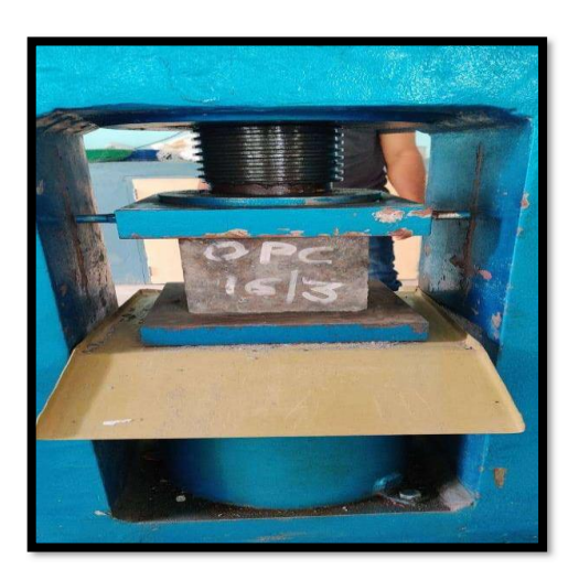
Fig. 5: Testing of Specimen for Compressive Strength