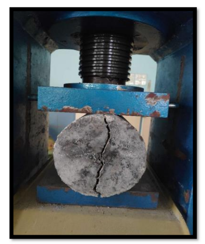
Fig. 7: Testing of Specimen for Split Tensile Strength