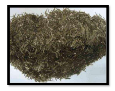
Fig. 2: Basalt Fibers

Table 1: Physical Properties of Basalt Fibers