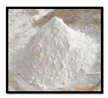
Fig 1: Metakaolin

Metakaolin (MK) is a mineral admixture which confirms class-N pozzolanic specifications. (Fig. 1.). It was prepared, by heating raw kaolin at 600^{\circ} C to 900^{\circ} C for 6 hours and grindingin high-speed ball mill.